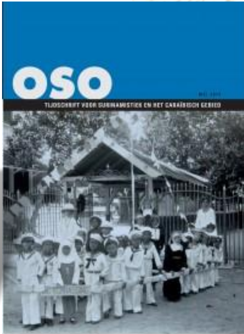
Taal Tori: Kultura den Boka